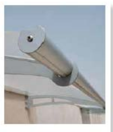
Anodized front gutter