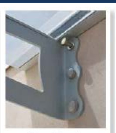
Complete wall mounting kit included