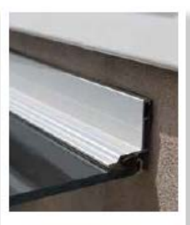
Back sealing gasket