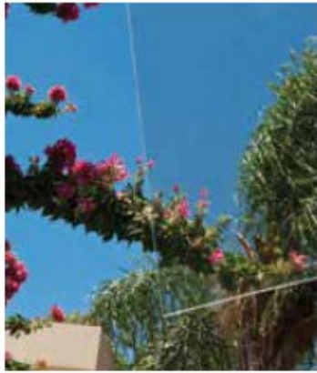
Excellent light transmission