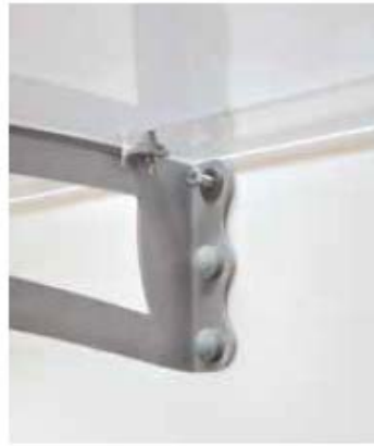
Complete wall mounting kit included